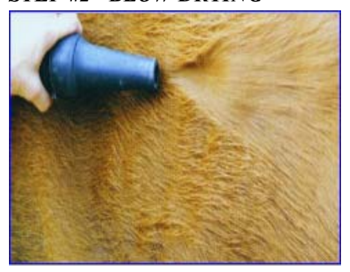
STEP #2 - BLOW DRYING