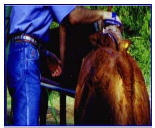
Pay special attention to areas such as the head, make sure that you scrub them adequately to remove all dirt and any other foreign matter.

Washing consists of cleaning the mud, manure, and dirt from the animal/s hair. It is also beneficial in stimulating hair growth. This is a very simple procedure but, you may get very wet at times. You will need the following when washing you animal: water hose, shampoo of you choice (try not to use harsh oil cutting shampoos), and a wash brush. While in the wash rack, secure your animal to the pipe stanchion to restrict his/her movement. Sometimes the wash racks at shows are very full so please try to be considerate of others and wait you turn. Once the animal is secure then wet the entire animal. While you are spraying water on the animal, squirt the soap in the stream of the water. This will evenly disburse the soap on the entire body of the animal. Now comes the important part, take your scrub brush and scrub the entire body of the animal. Don't forget about the face, legs, and underline. It is very important that you get all of these places very clean. Also, don't be afraid to scrub hard, you will not hurt your animal at all. Some kids will just use their hands to wash the animal, much like they wash their own hair, this method however, will not cut the mustard. You must scrub hard. After you have completely washed the animal, rinse all of the soap from the body of the animal. If you do not remove all of the soap residue from the hair coat, your animal may end up with a bad case of dandruff, which can make the animal's hair coat to look "flakey".